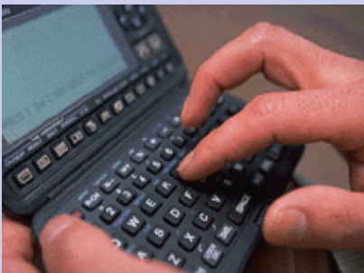
Evolving into modern technology.